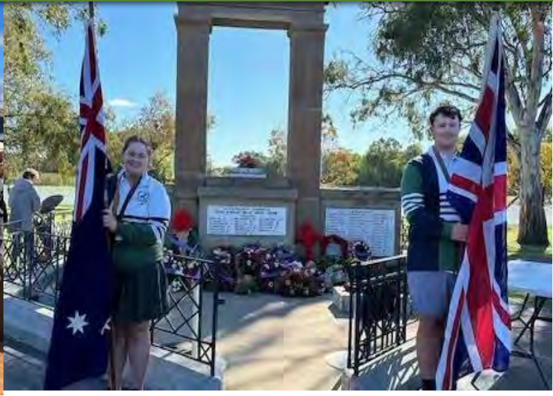
Finley High School students at Anzac Day Services