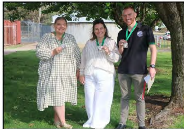
Recognition for hard work during CPM review last term