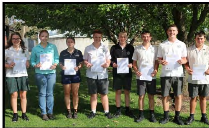
Maths Competition Awards