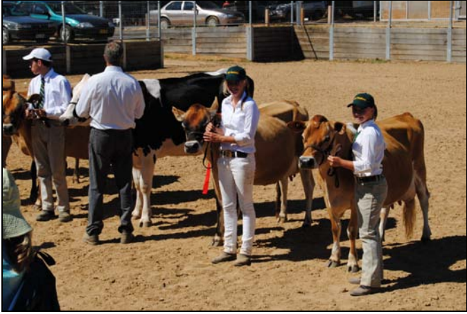
Above: Students lining their cattle up after judging.