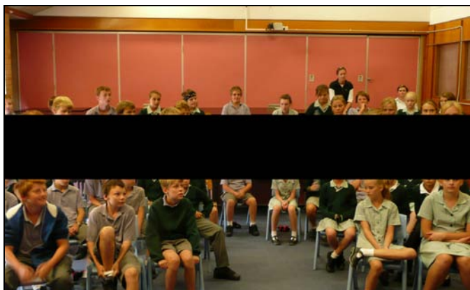
Above: Class 7D at the Disability Awareness Talks.

On Thursday 11 th March, Year Seven were involved in the annual Year Seven Disability Talks. The purpose of the day is to give the students a glimpse of some of the specific needs of people in our community and our school. Each class spent a period in the VTR room, where they were encouraged to realise that students with a disability have much to contribute to our school.