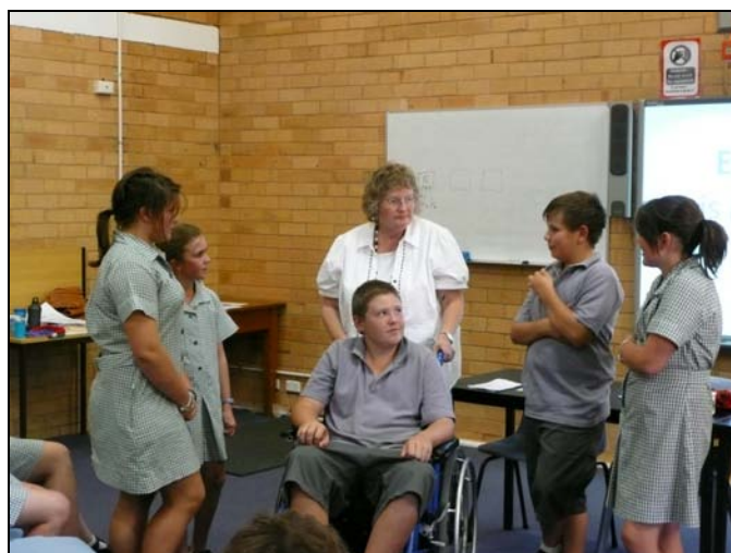
Above: 7B students learning about wheelchair etiquette.

The key message of the sessions is that “everyone is important at Finley High School”. They were given activities to help them understand how they can assist others at school.