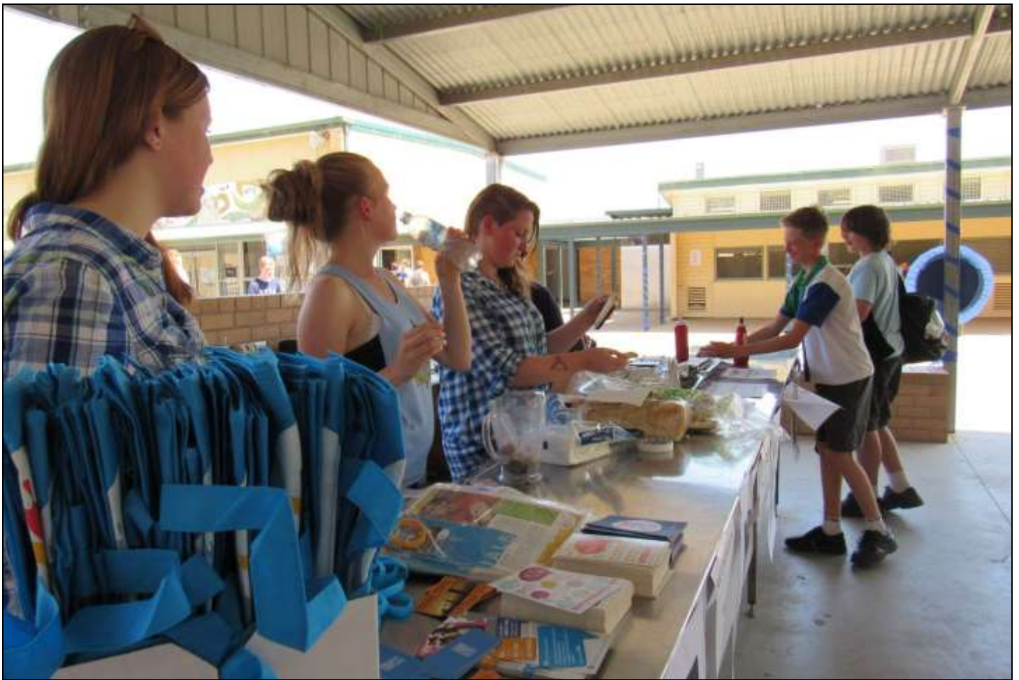
Above: SToMP Blue Day information and sausages.