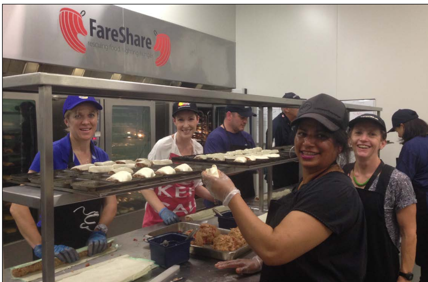
Above: Career Advisers at Food Share

As part of the new ASPIRE early entry programs that focus on volunteering - the careers advisers also looked at volunteering organisations and actually volunteered at the FOOD SHARE kitchen where they assisted with the production of over 1400 sausage rolls and over 1400 quiches all made from rescued or donated food. Fareshare is a not for profit food rescue organisation. With the help of volunteers they prepare and cook 25,000 meals each week for charity organisations. Fareshare also offer school students the opportunity of volunteering in small groups. Students are also educated on food rescue and the reality of hunger in our community, whilst contributing actively to support those in need.