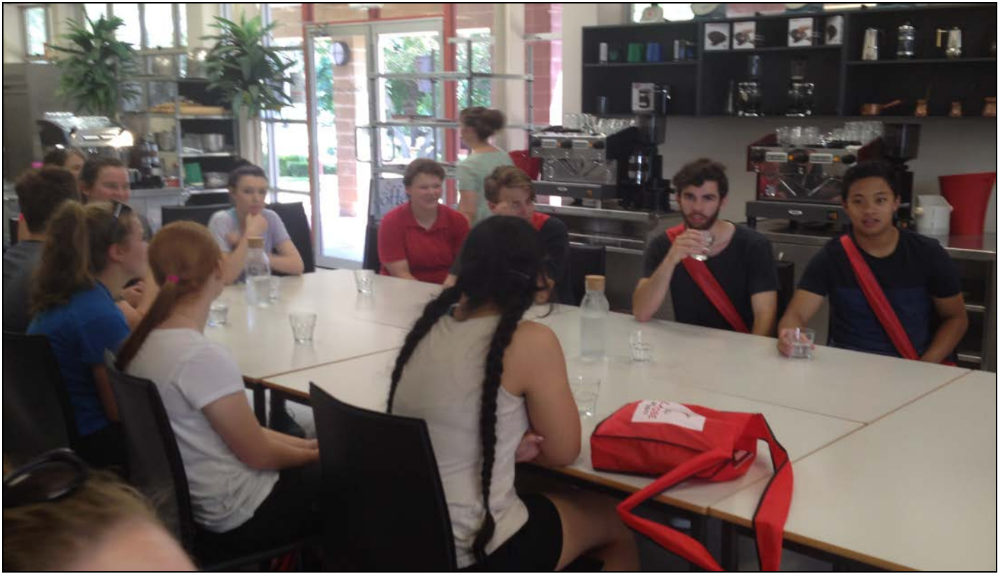
Above: Students listening to a Hospitality talk at Wodonga TAFE.