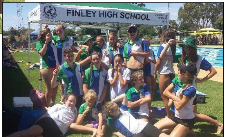
Below: Girl's Swimming Team