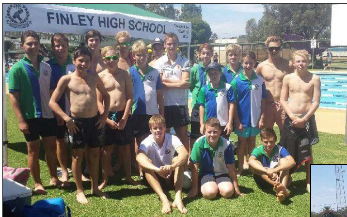
Left: Boy's Swimming Team