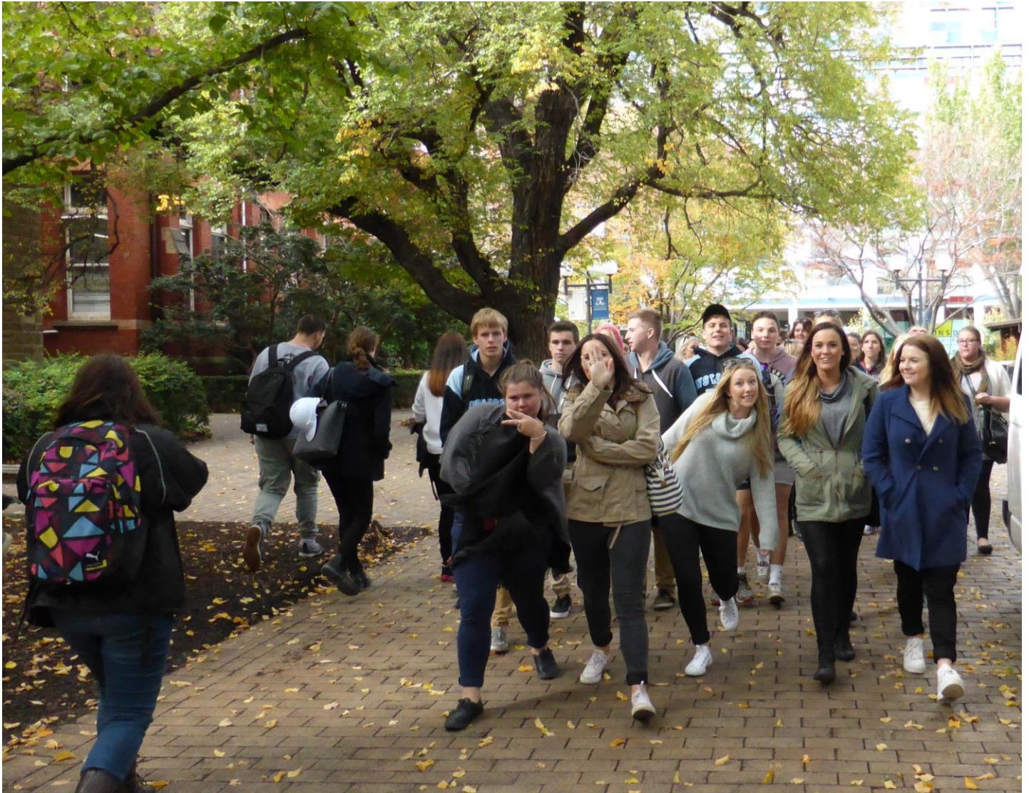
Above: Students walking through Melbourne University.