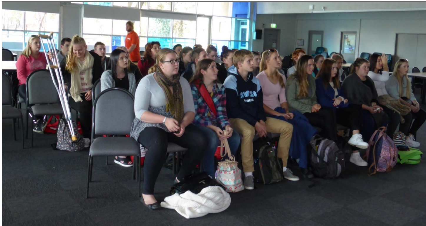
Above: Information session at Bundoora

students immersed themselves in university culture with a casual morning tea in the Agora student area followed by some self exploration of the campus shops and markets. LaTrobe Bundoora then provided an information session on what it has to offer and a campus tour of the facilities and accommodation.