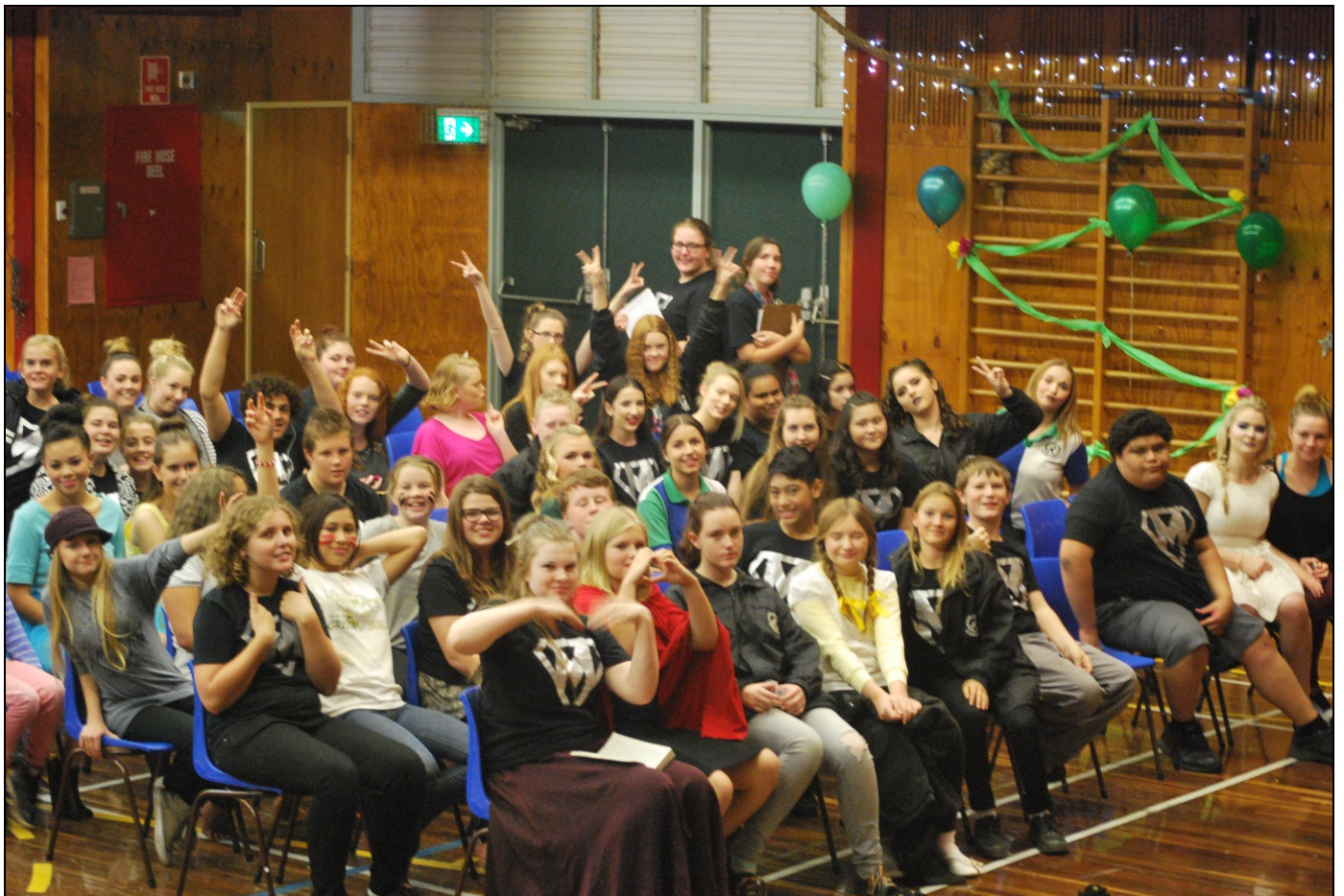
Above: MADDD Team 2015