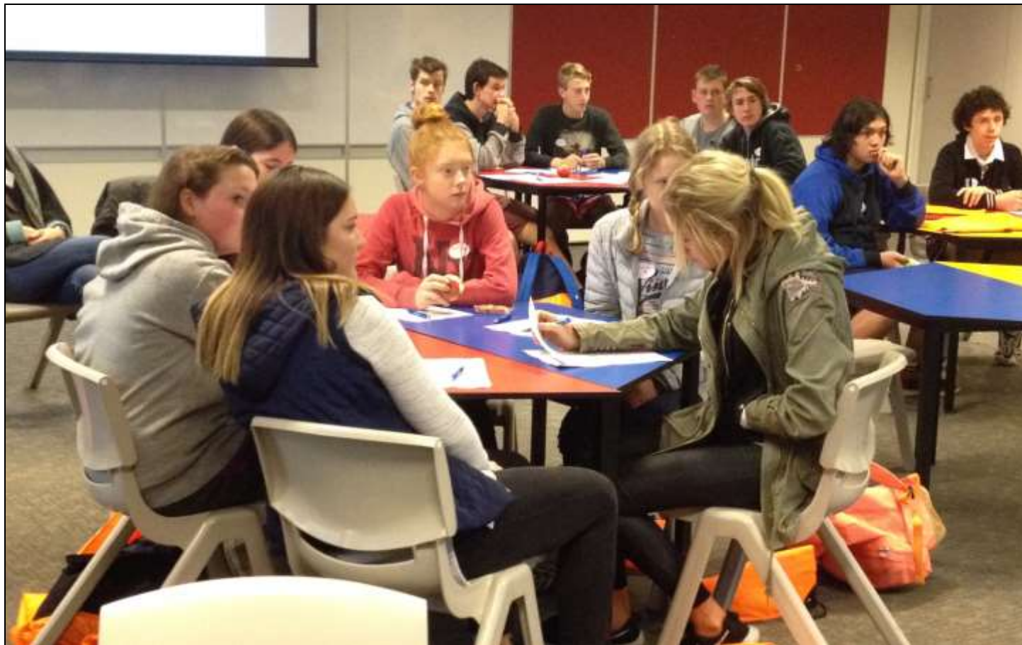
Above: Students participating in a workshop.