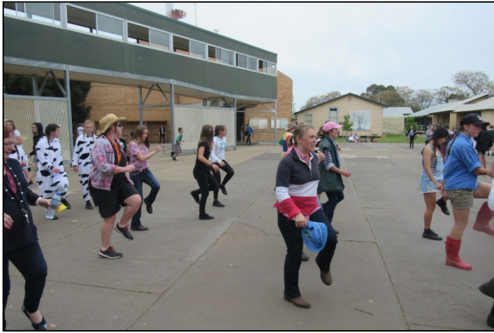
Above: Students enjoying the lunchtime activities organised by the SToMP Team