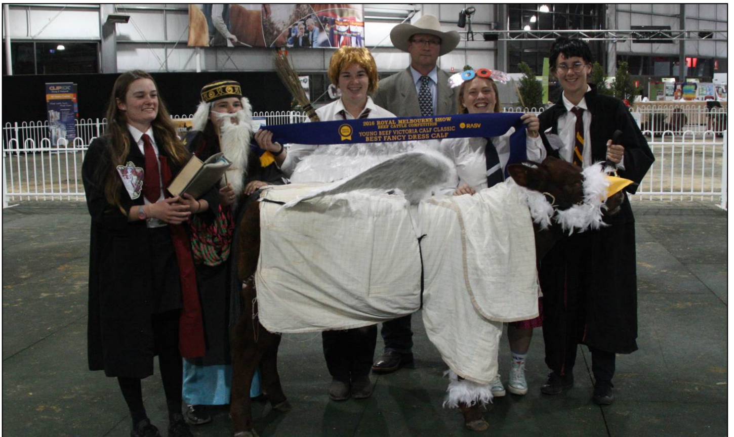
Above: First Place in the Best Fancy Dressed Calf.