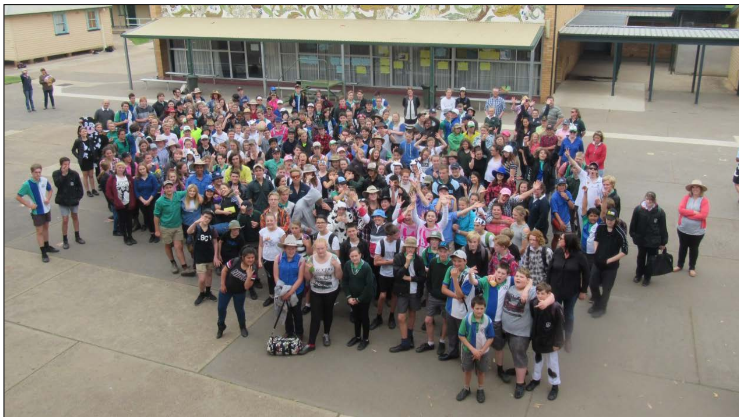
Above: Group photo of students involved.

Last Friday, the SRC students held an “Udderly Awesome Day” at school to raise awareness and financial support for dairy farmers who are doing it tough at the moment. Students and staff came to school dressed as farmers, cows or simply in black, white and brown – the colours of cows. Milkshakes and ice creams were sold throughout the day, and small donations were collected in roll call. Country music was played in the playground at lunchtime. It was great to see students singing, dancing and truly enjoying themselves. Over $550 was raised which will be sent to the school in Sydney who organised this initiative. It will then be forwarded to the appropriate dairy farmers organisations for distribution. Congratulations, SRC, on organising this wonderful day.