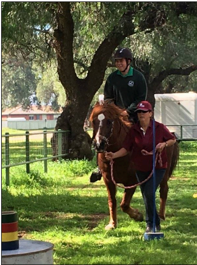
Left: Max trotting.