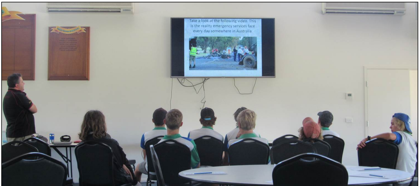
Above: boys participating in one of the 'risk taking' sessions.