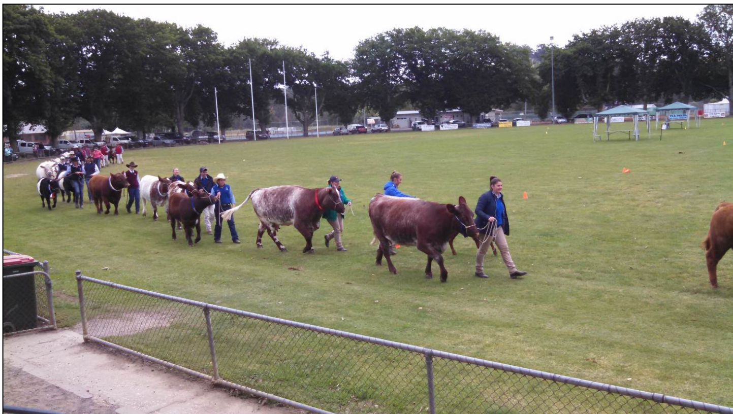
Above: Students leading in the Grand Parade.