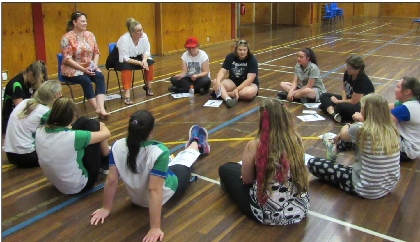
Above: girls participating in the 'identifying strengths' session.