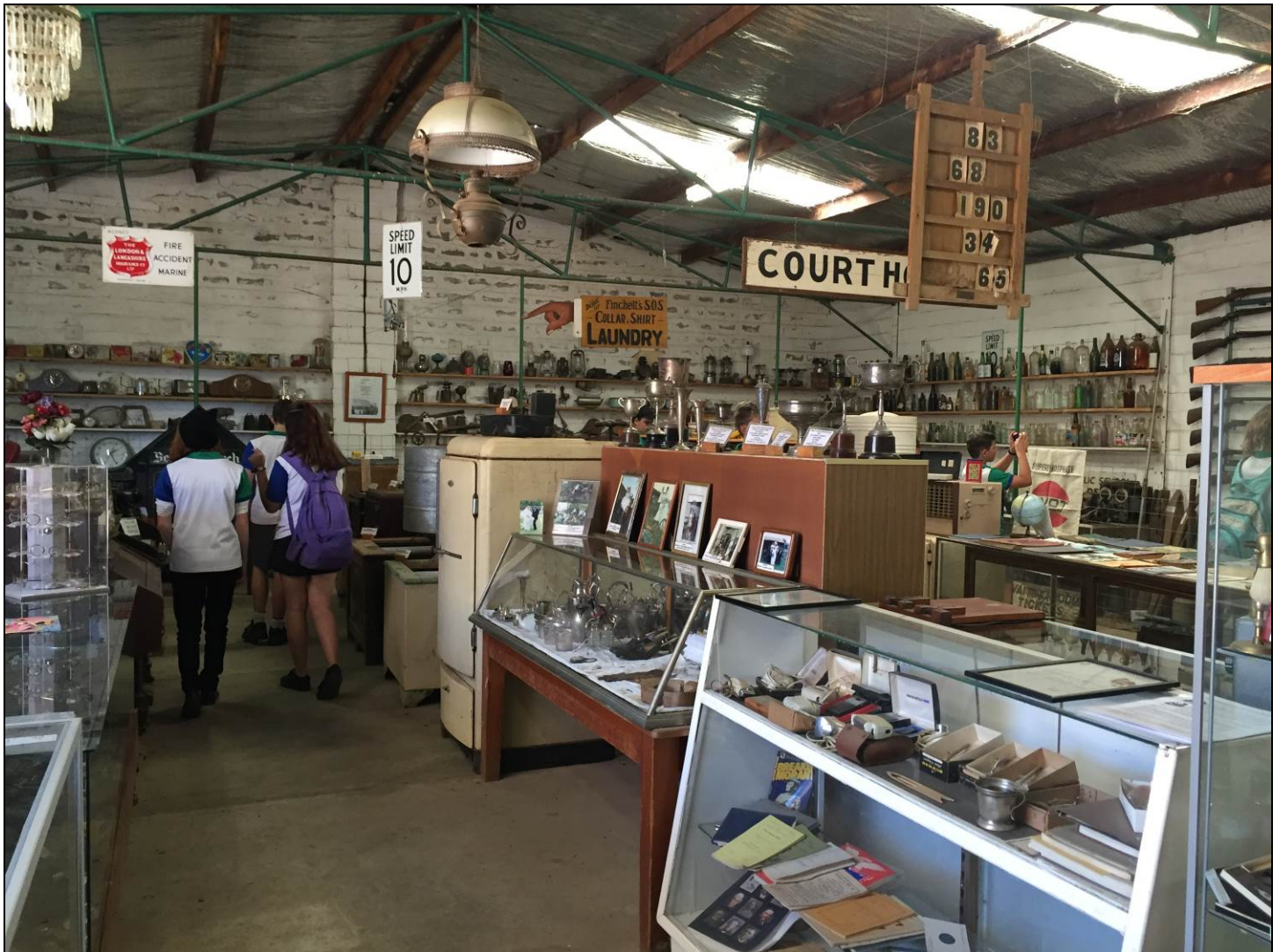
Above: Students looking around the museum for ideas.

During period two on Tuesday, March 22, students from 8C went on a mini-excursion to the Finley Historical Museum to gain some inspiration for completing their upcoming English assessment task for the Visions of Identity in Fictional Worlds unit studied this term. Their assignment involves drawing/painting/constructing an imaginary 'lost thing' creature (based on our film study of Shaun Tan's award-winning short film, The Lost Thing ), which must contain both mechanical and organic components. Students perused the incredible array of antique items on display, from old fridges and classic household items to farming machinery and vintage cars. Students took photos or sketched pictures of unusual things they saw, and got some great ideas to use in their assignments. Even though it was a brief visit, students had a good time extending their learning beyond the classroom. Many thanks to Dan, Henry and the team at the museum who answered our questions, showed students around and demonstrated how an old engine worked.