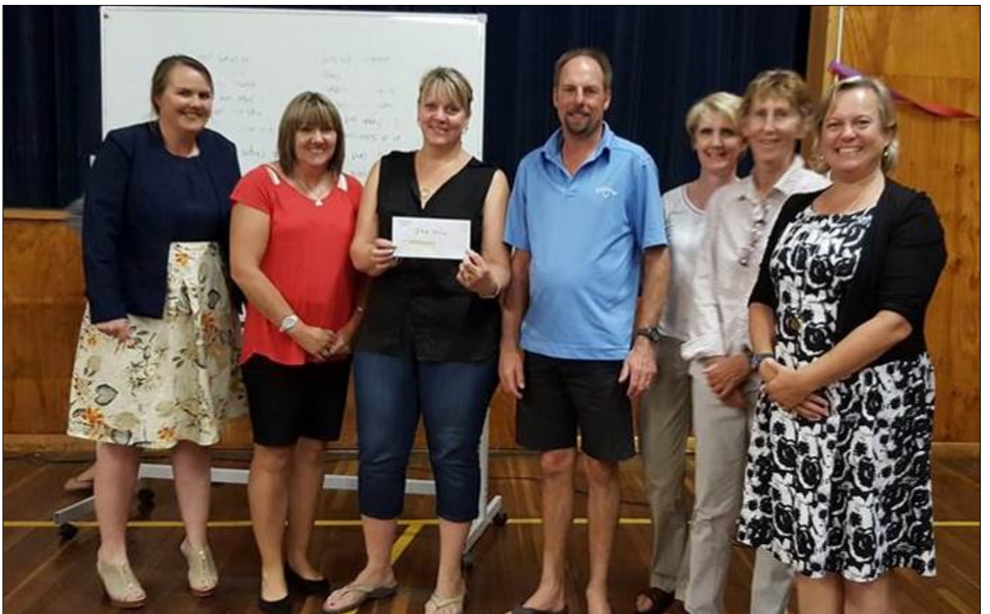
Below: Runners-up – Sharp table.