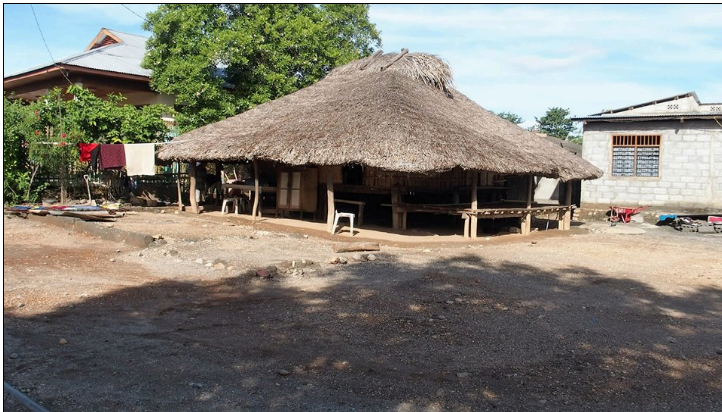
Above: Traditional style housing