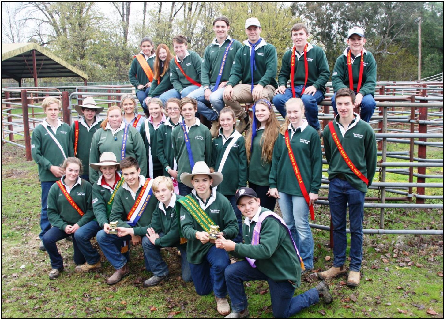
Above: 2016 Show Team