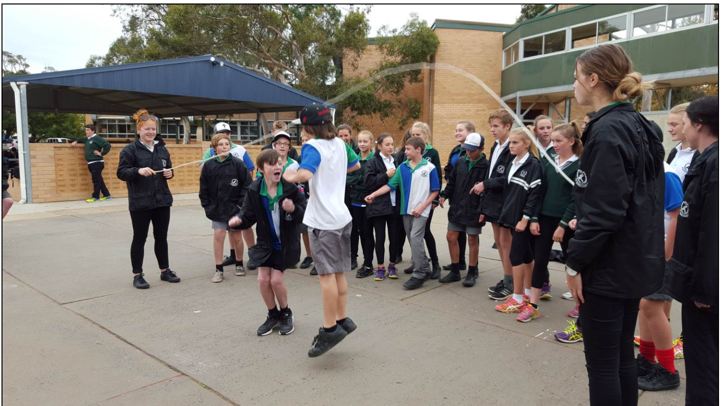
Above: Students participating in jump rope.

The group looks forward to running more activities next term.