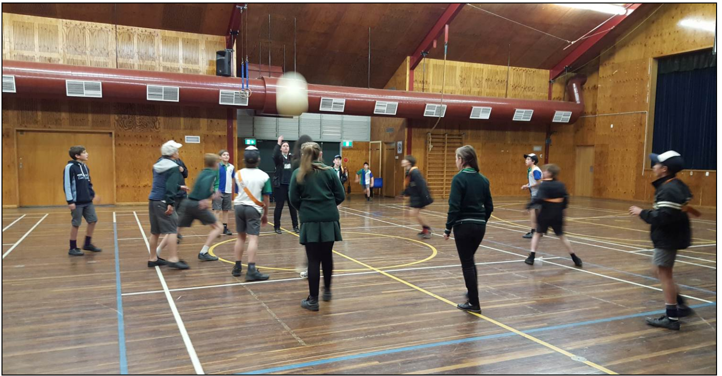
Above: Students participating in Mat Ball