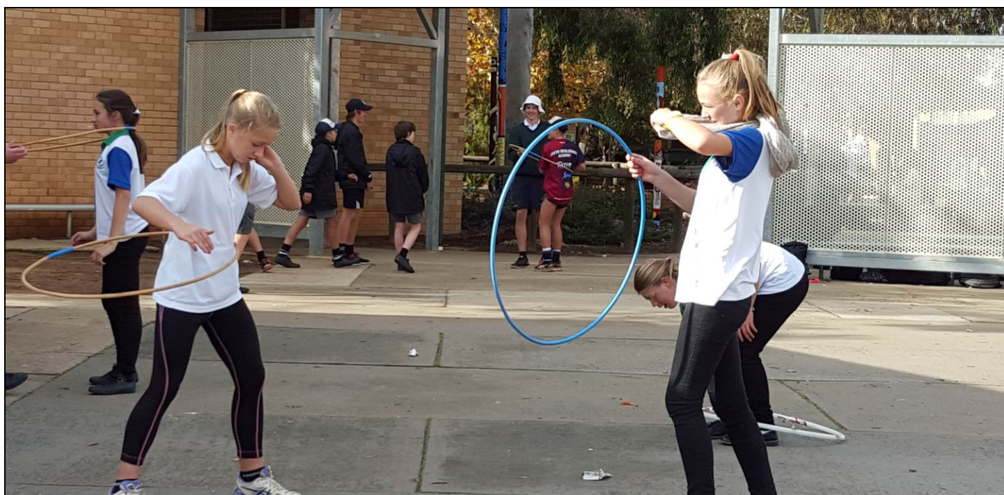
Above: Students participating in Hula hoop

They facilitated activities and competitions such as; handball, hula hoops, mat ball, zumba and air guitar. Each week they had approximately 50 or more students participate. When in the quadrangle they played music over the loud speaker and more recently were able to use the Blue tooth Speaker kindly donated by Purtils to run Zumba and Air Guitar in the hall.