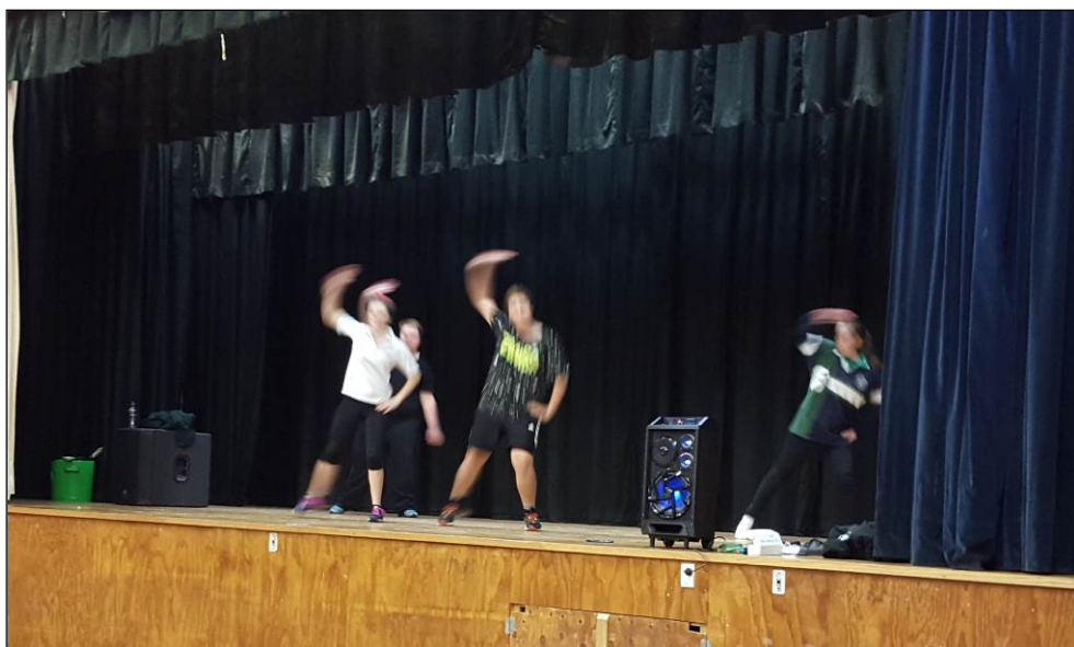
Left: Speaker system kindly donated by Purtills.