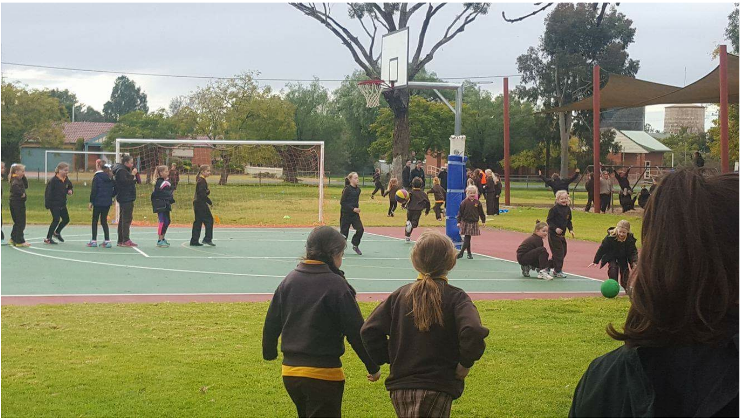
Above: Students participating in activities.