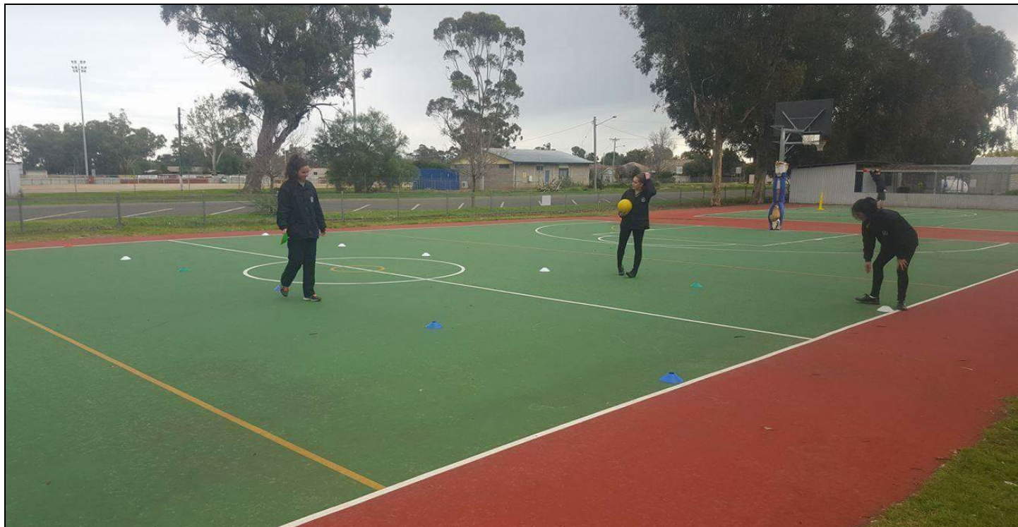
Above: Students setting up an activity.

At the conclusion of Term Two, a group of Year 10PASS students from Finley High School volunteered their time and efforts to enrich the day of a number of young people at Finley Primary School. The high school students planned, organised and implemented a sports and activities day for the benefit of the younger students as part of their volunteering unit in PASS. At the conclusion of the day, the primary school students received a complementary sausage sizzle, prepared entirely by individuals from the Year Ten group. The Year 10PASS students would like to thank Haynes Butchery and The Finley Bakery and Patisserie for their generous donations.