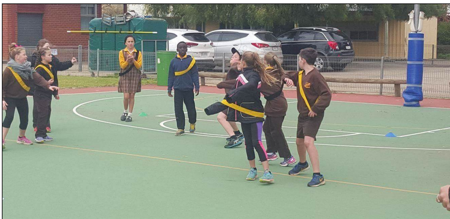
Below: Primary students participating in an activity.