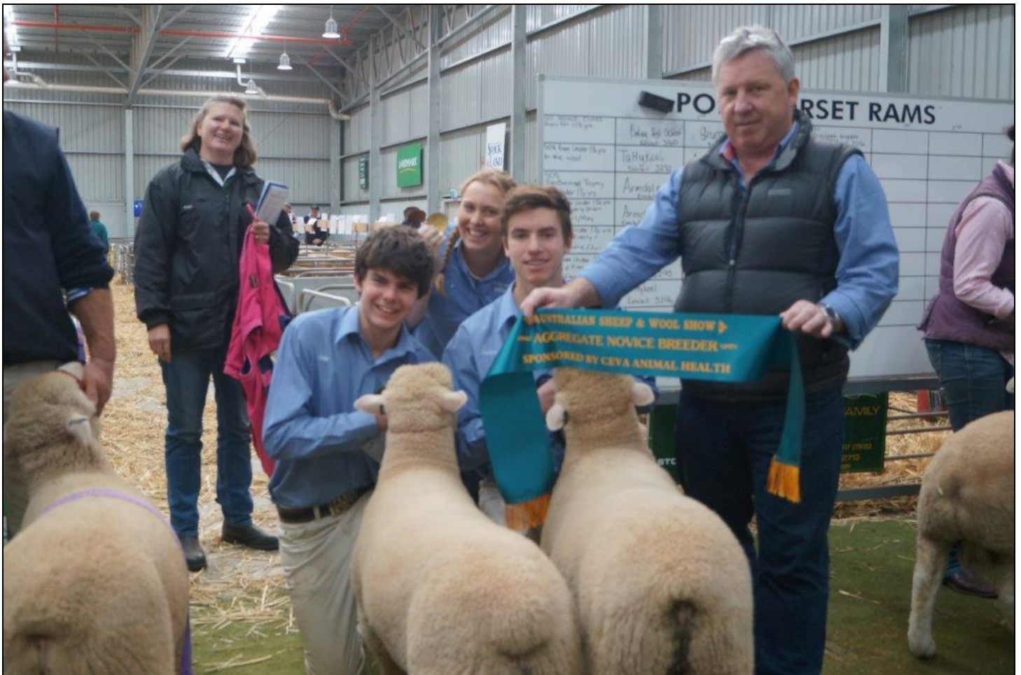
Above: Aggregate Novice Breeder.