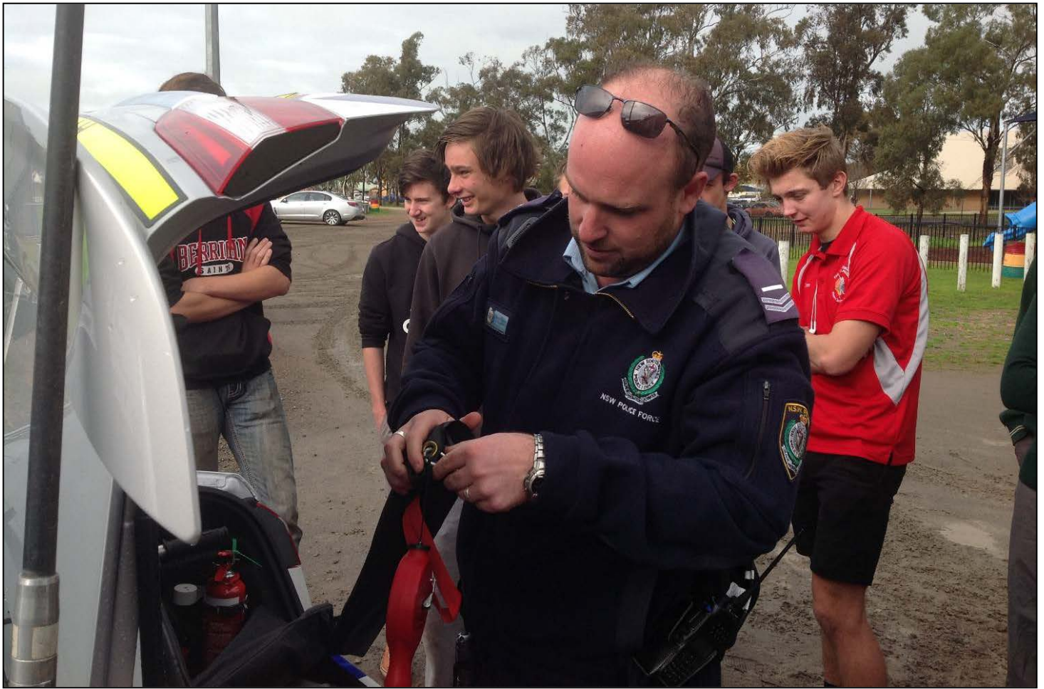
Above: Students checking out the road spikes with highway patrol.