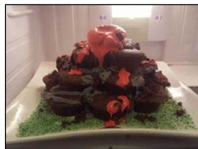
Above (top): Jai Armstrong's volcano