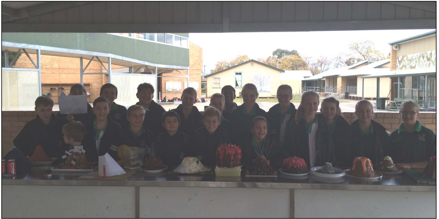
Above and below: 7C volcano models.