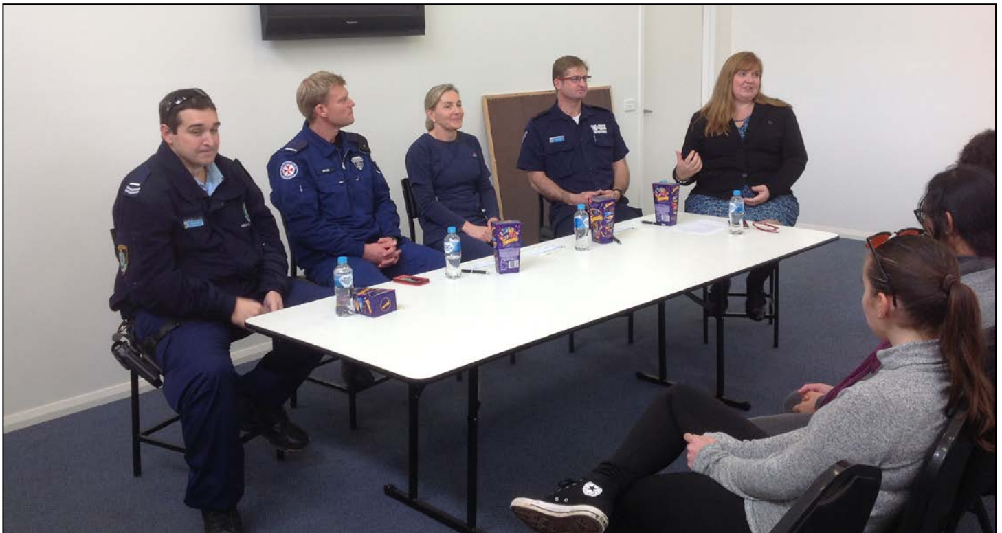
Above: Emergency services panel.