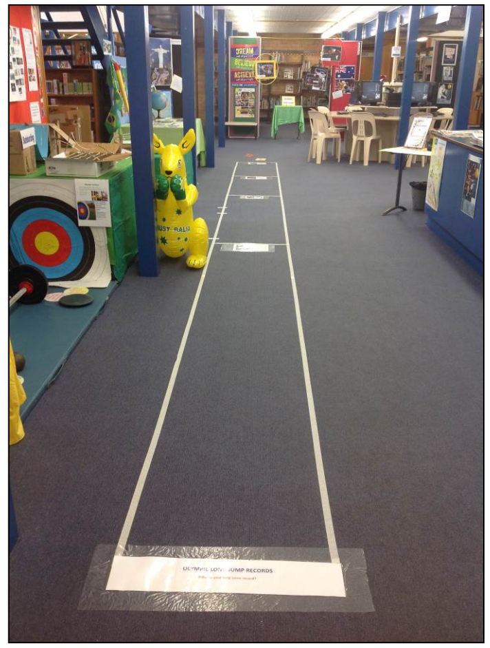
Above: Long jump records marked out.