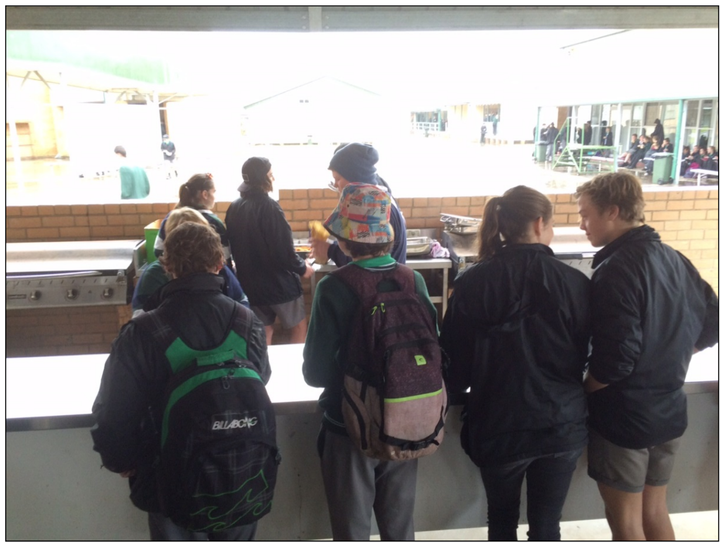
Above: Customers lining up to purchase their nuggets, dim sims and ice-cream.

For a recent assessment the HSC Work Studies class were asked to organise and run a business at school as part of an Enterprise module. This entailed them deciding what to sell, pricing the items, speaking with consultants both within the school and from the local community, advertising, setting up, cooking, and dealing with customers. The members of the class chose to sell chicken nuggets, dim sims, and ice cream; they had to decide where was the best place to purchase the items from and what the profit margin would be. There were obstacles faced by the team, namely where to obtain financing from (they determined that they would self-finance to an extent). At the end of the day they discovered that working together was the best way to overcome any problems that occurred and a majority of the profits made on the business went to the Year Twelve fund.