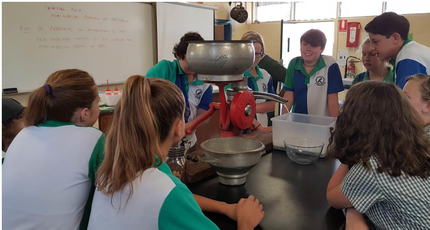
Above and below: Year Seven Technology Mandatory students separating cream out of whole milk.