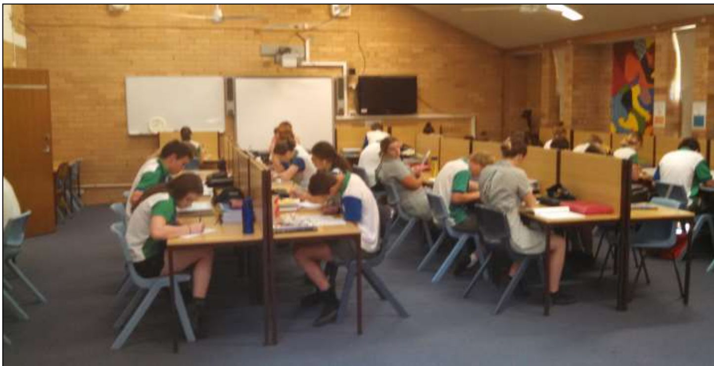
Above: Year Eleven students working in IXL.

Keep up the great efforts in IXL in Year Eleven and Year Twelve and you will reap the rewards.