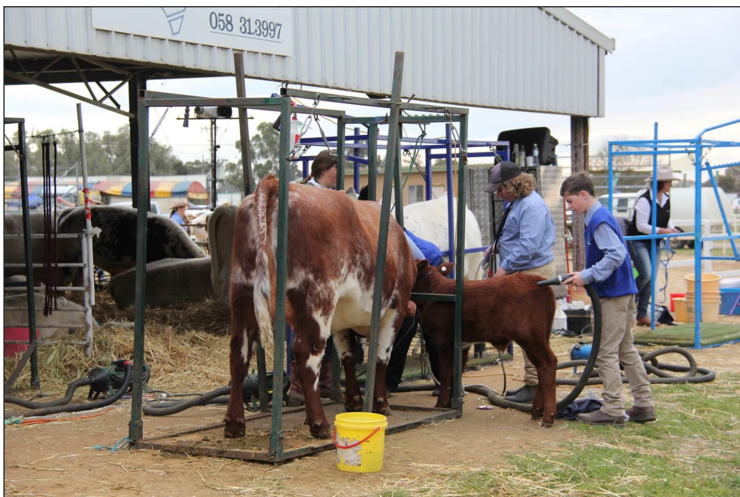
Above: Students preparing the cattle for the show.