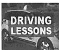
SAFE DRIVING LESSONS