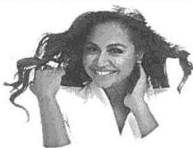
Jessica Mauboy Indigenous Recording Artist