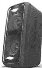
SONY MEGA BLASTER