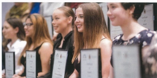
The Australian Veterans' Children Assistance Trust (AVCAT) is a national independent charity.

Scholarships managed by AVCAT provide up to $4000 per year, for three years, to full-time students at university, TAFE College or Registered Training Organisation. To be eligible a student must be the child, step-child, foster child or grandchild of an ex-serving Australian Veteran. Scholarships are awarded to students based on financial need and academic merit. Visit www.avcat.org.au for more information.