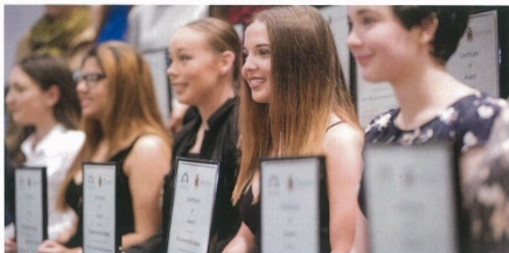
The Australian Veterans' Children Assistance Trust (AVCAT) is a national independent charity.

Scholarships managed by AVCAT provide up to $4000 per year, for three years, to full-time students at university, TAFE College or Registered Training Organisation. To be eligible a student must be the child, step-child, foster child or grandchild of an ex-serving Australian Veteran. Scholarships are awarded to students based on financial need and academic merit. Visit www.avcat.org.au for more information.