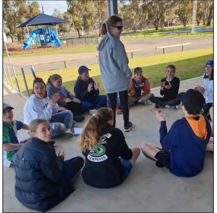
Above: Group 2 teamwork