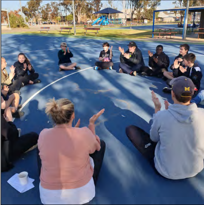
Above: Group 1 teamwork

On Wednesday 3 rd July some of our Year Twelve students organised and facilitated a Year Seven Acceptance Day. The senior students ran activities and discussions in small groups which focussed on healthy friendships, resilience and identifying strengths. They also run a Question and Answer session about navigating high school. We are very proud of all the students involved, especially our Year Twelve students who demonstrated great initiative and leadership skills.