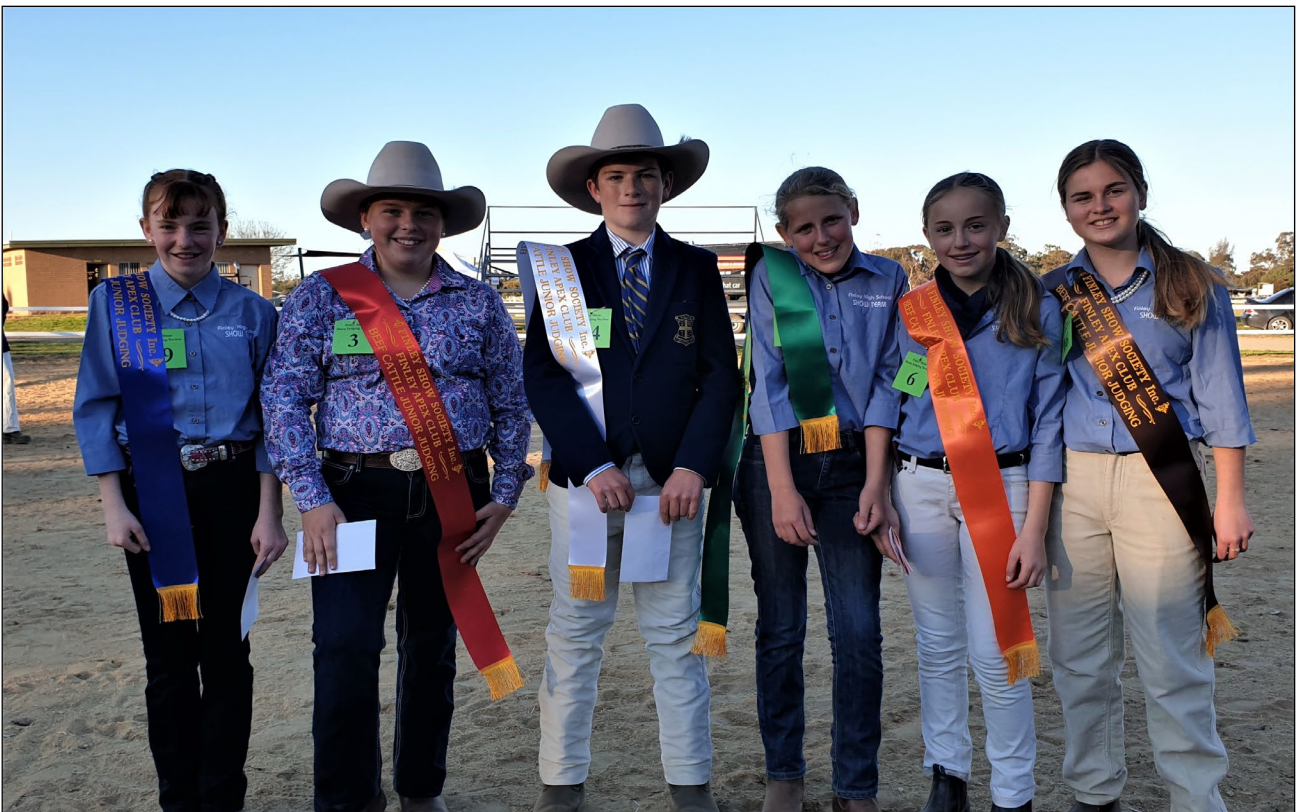
Above: Junior section for judging