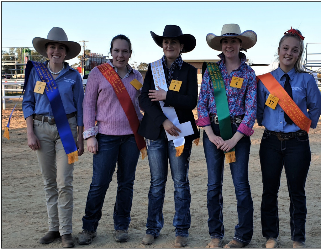
Above: Senior section for judging