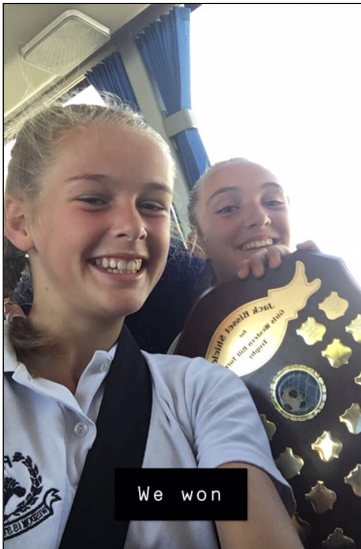
The Under 15 girls soccer team travelled to Hay and had a successful win.