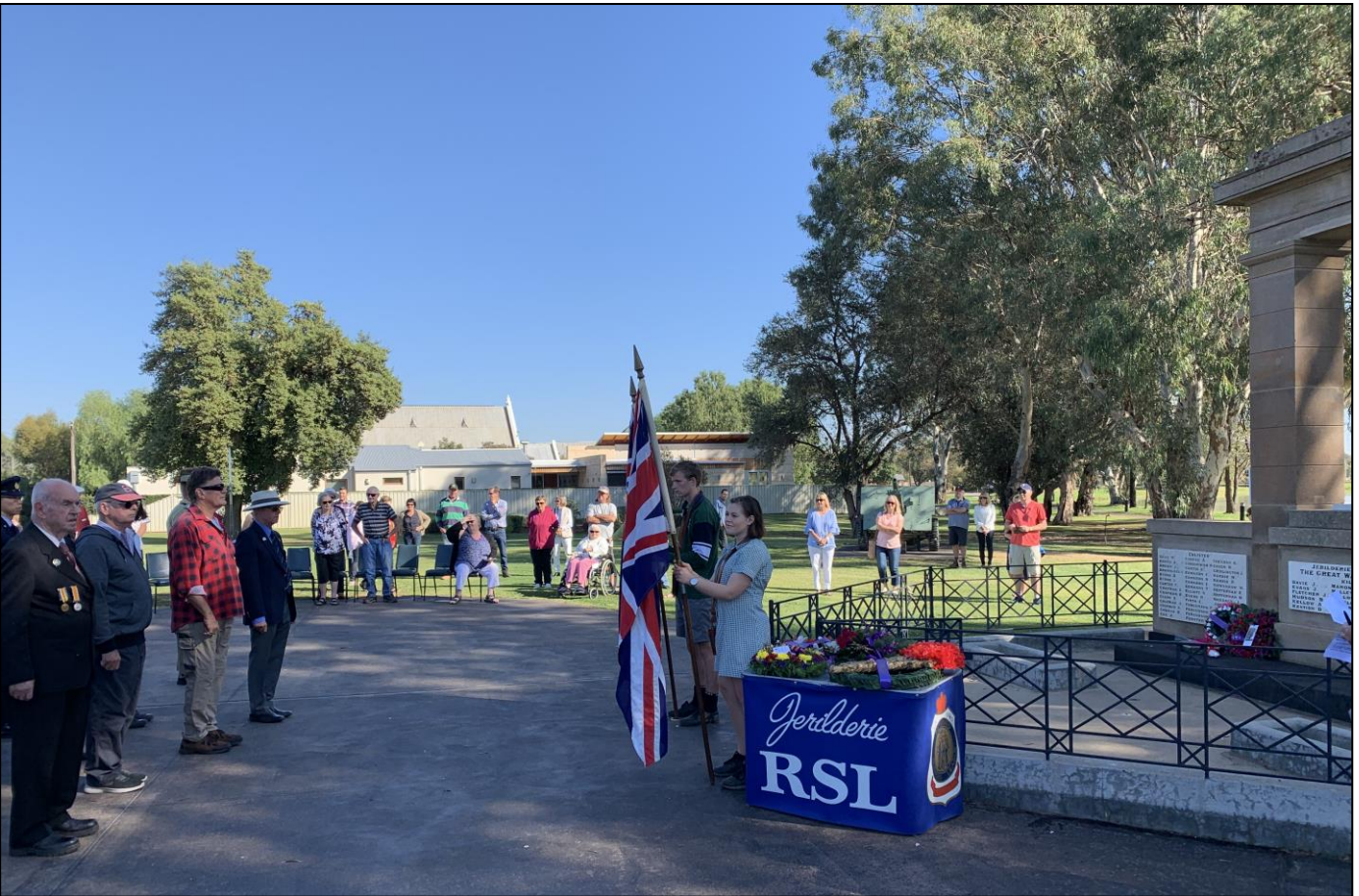
Above: Jerilderie Anzac Day