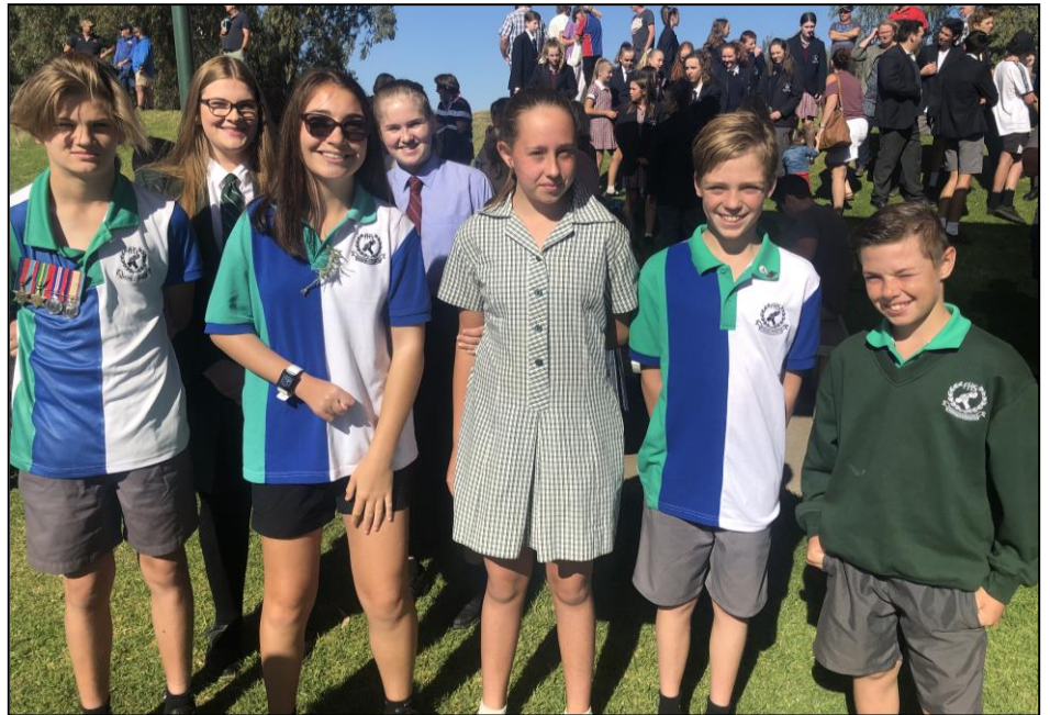
Above: Students at the Tocumwal Anzac March