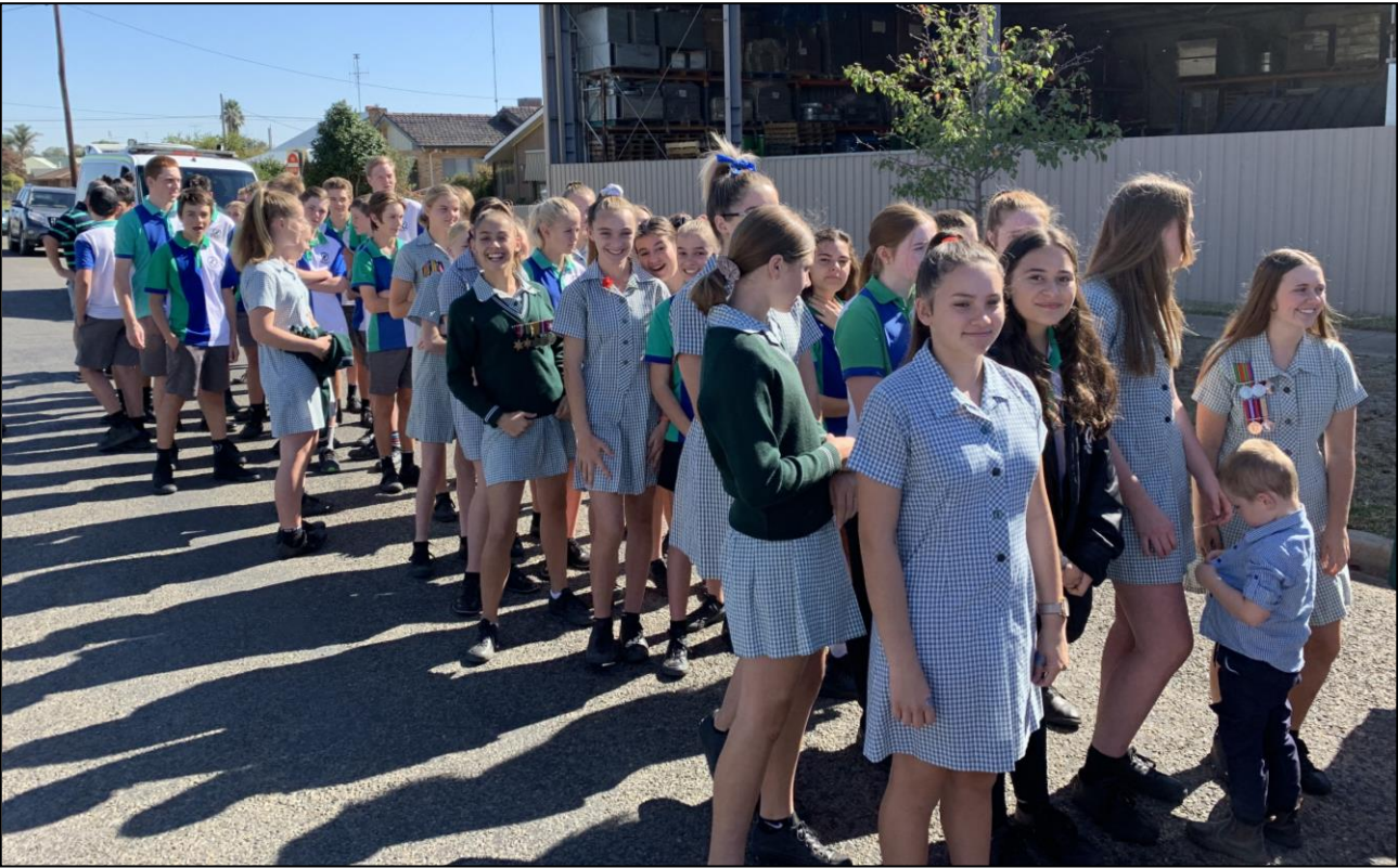
Above: Students assembling for the Anzac March in Finley.