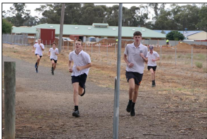
Above: Students running the cross country course.

The students will now compete in Gundagai in the Riverina Championships