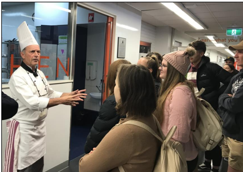
Above: VCE Expo, William Angliss TAFE

An early start on day 2 saw students meandering around Vic Markets before doing a guided walking tour through William Angliss TAFE. Here students saw students in action baking, cooking and even making chocolate decorations. Students got to look in on the hospitality setup of commercial kitchens, dining rooms and 4 different styles of motel rooms. Several teachers popped out of class to speak with them and the chocolate teacher even came bearing chocolate tasters. Finally an Air Hostess safety demonstration presented by the current class ensured all students were pleased they were not aboard the William Angliss mock up plane. Morning tea was in the Bakehouse at William Angliss, before heading off again.