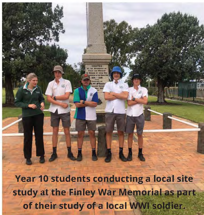
Year 10 students conducting a local site study at the Finley War Memorial as part of their study of a local WWI soldier.